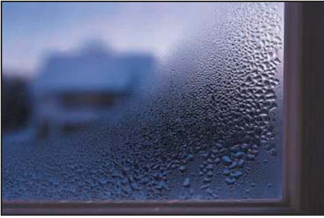
Condensation on the inside of a window-pane.