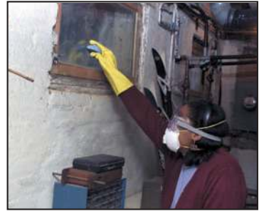
Cleaning while wearing N-95 respirator, gloves, and goggles.

■ Wear goggles. Goggles that do not have ventilation holes are recommended. Avoid getting mold or mold spores in your eyes.